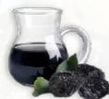
PRUNE JUICE CONCENTRATE